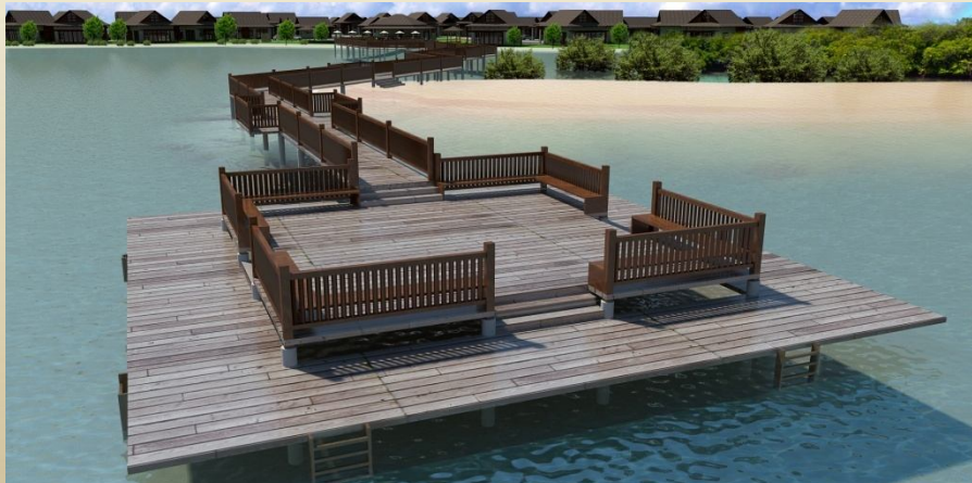
Actual View of Mangrove Park