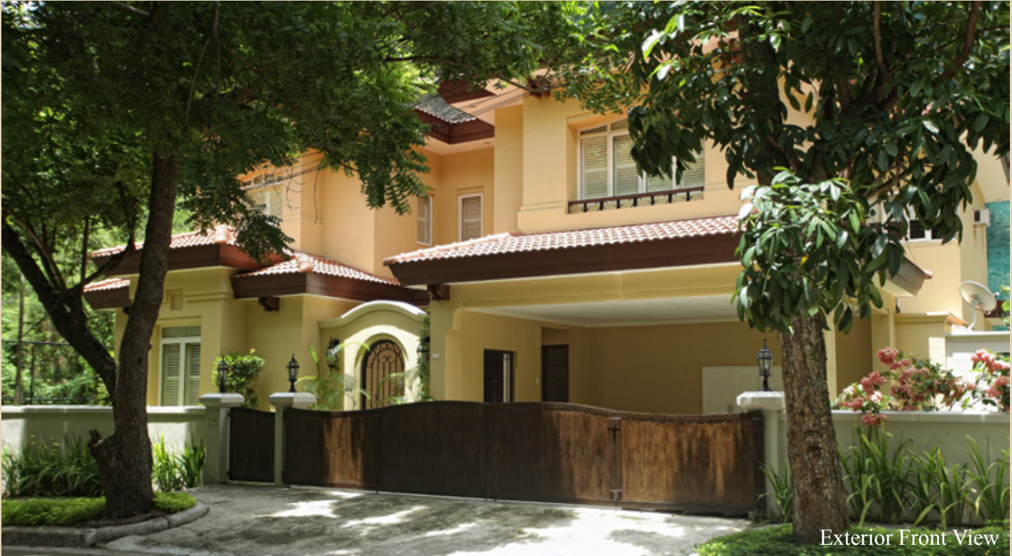
Exterior Front View